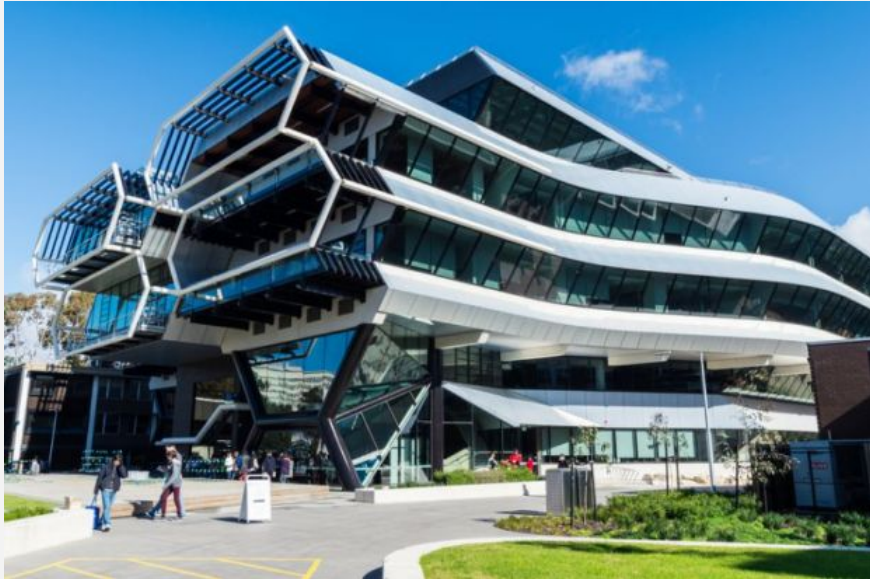
Melbourne's Monash University a popular choice